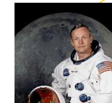
Neil Armstrong 1969