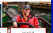
Ingrid Bergman – Present