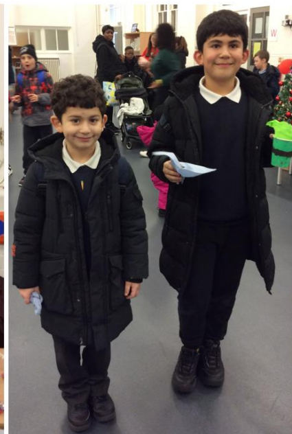
Year 3 National History Museum visit